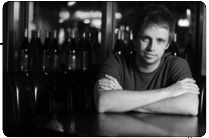
MEMBER KAL HOURD.