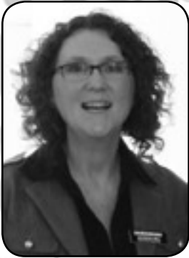
BY NOREEN NEU, EXECUTIVE DIRECTOR

2008 has proven to be a year of change...though not the kind we were planning at the start of this short fiscal year. In January we were still ecstatic at the increased funding announced in late 2007, and were actively ramping up the development of new programs, increasing our