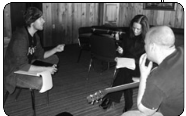
COLLABORATORS WORK ON A SONG IN THEIR BREAKOUT GROUP

We wish to thank The SOCAN Foundation for their financial support. ●